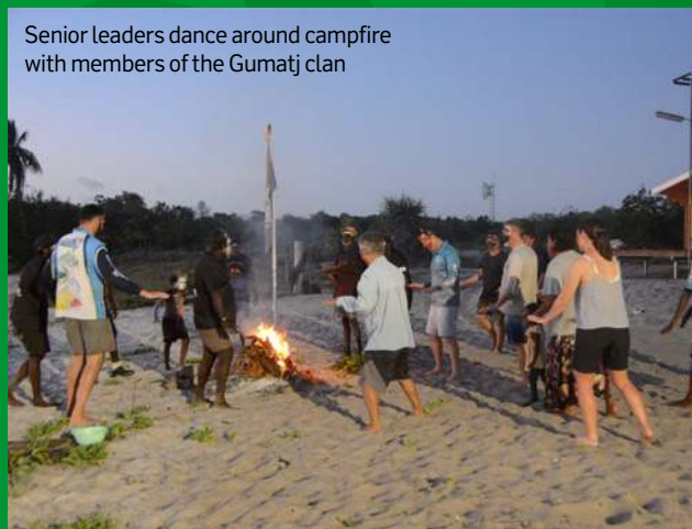
Senior leaders dance around campfire with members of the Gumatj clan