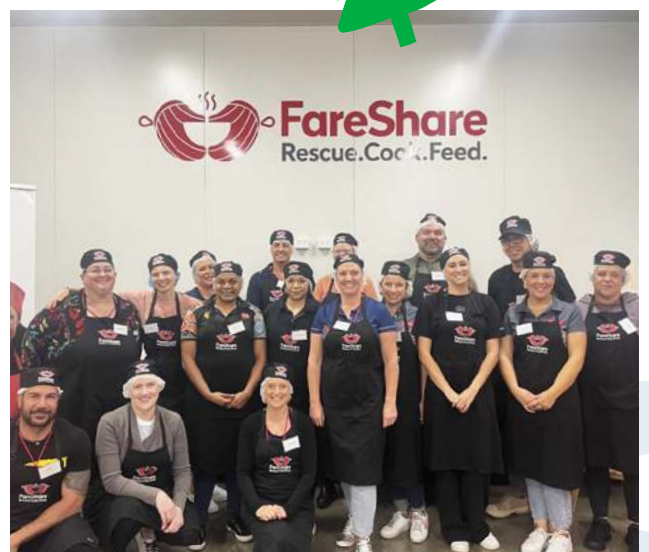
Indigenous Affairs team volunteering at FareShare