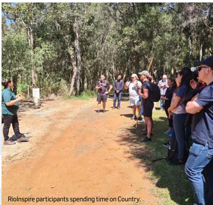
RioInspire participants spending time on Country.

On completion of the program, all participants will receive a Certificate of Executive Management Development (CEMD) and receive two credit points towards the AGSM Master of Business Administration (MBA) program.