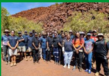
Rio Tinto and members from PCLMP

Over the next five years, the members of the PCLMP will strengthen their ranger programs, creating a network of knowledge-sharing and career development. The priorities and training programs have been developed by Traditional Owners for Traditional Owners and aim to increase Aboriginal ownership and determination of the program and its outcomes.