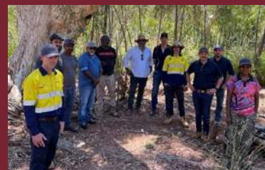
Rio Tinto and members of the Yindjibarndi community

We are changing the way we work with Traditional Owners in the Pilbara and this updated agreement is another step on our journey to rebuilding trust and modernising our relationships with external partners.