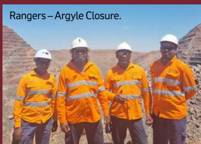
Domino I'll be spending it with family in Perth sightseeing.

Cooking with my sister on Christmas Day which will feed 30 people. I'm looking forward to it!