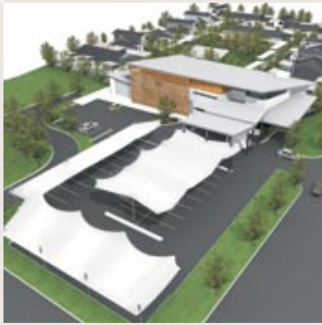
An artist's impression of The Clem Jones-Sunland Leukaemia Foundation Village.