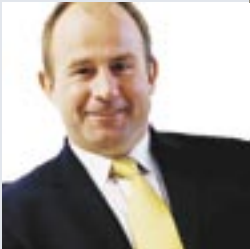
Quentin Bryce, AC Governor of Queensland

These mature and carefully considered approaches are a model for re-engaging communities throughout our State. I praise Xstrata for their innovation and leadership, and the opportunities and possibilities that their actions offer us all.